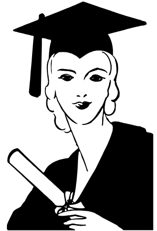
Fl. International University Nova Southeastern University University of Florida University of North Florida University of South Florida

and nursing faculty is particularly acute for community/public health. There are five schools (see caption) in Florida that provide a Masters in Public Health. This is an interdisciplinary degree, usually a second master's degree, for health care professionals. A listing of schools providing RN-BSN will be in the next newsletter.