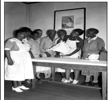
Teaching Midwives....