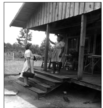
PHN Makes Home Visit